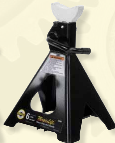
32066 6 Ton Capacity Per Pair